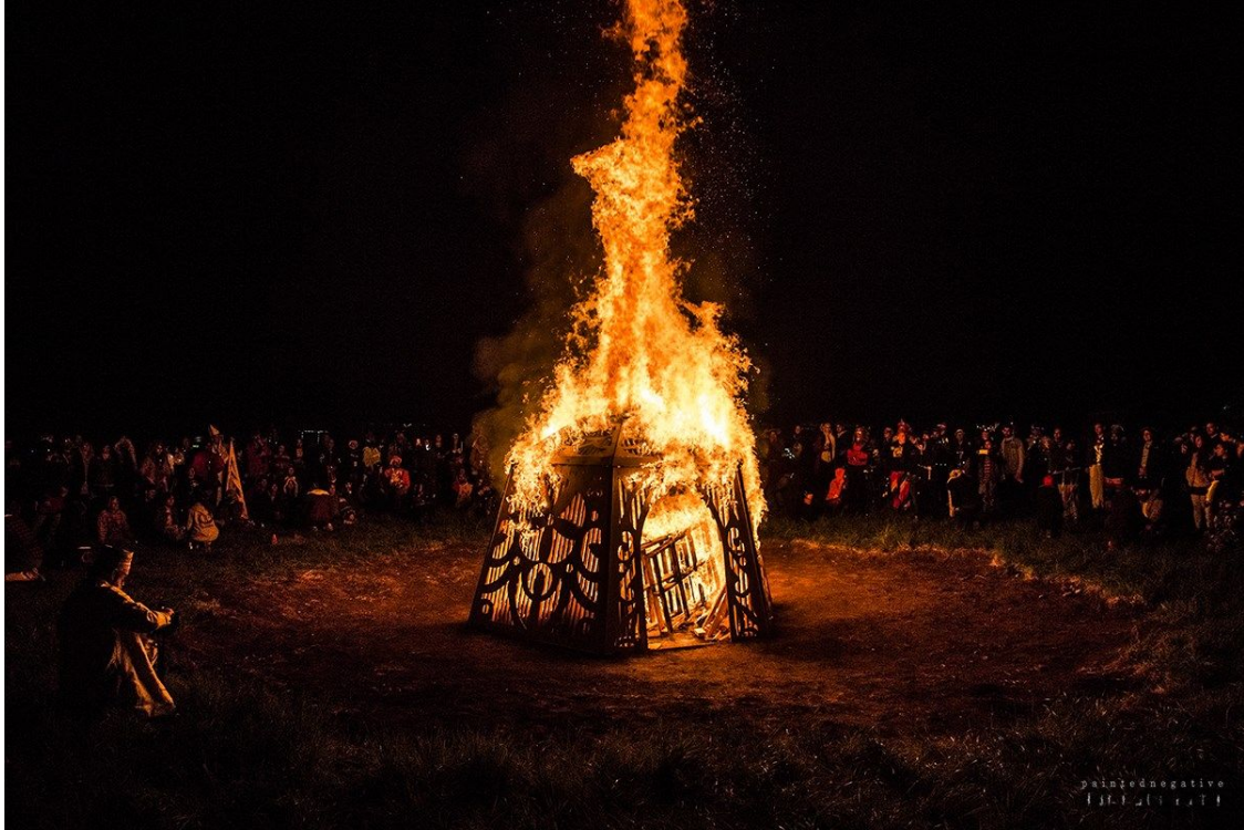
TEMPLE OF RELEASE