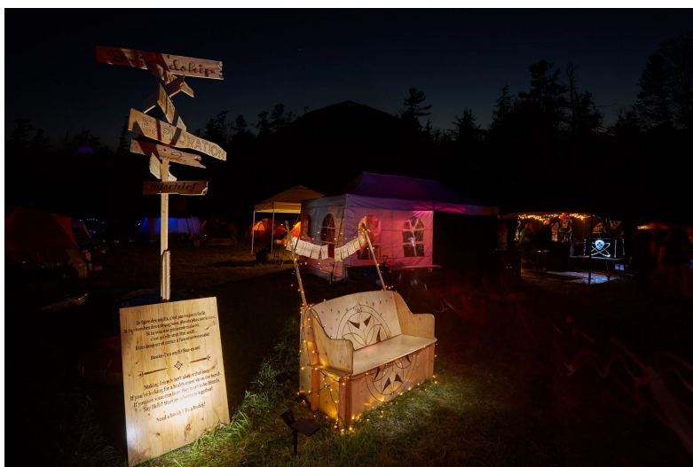
BUDDY BENCH

I have so much love for you all, and can't wait to see you again, whether when we venture to Hyperborea again next year, or better yet, before!