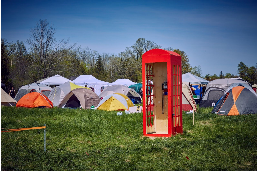
CONNECT-A-BOOTH