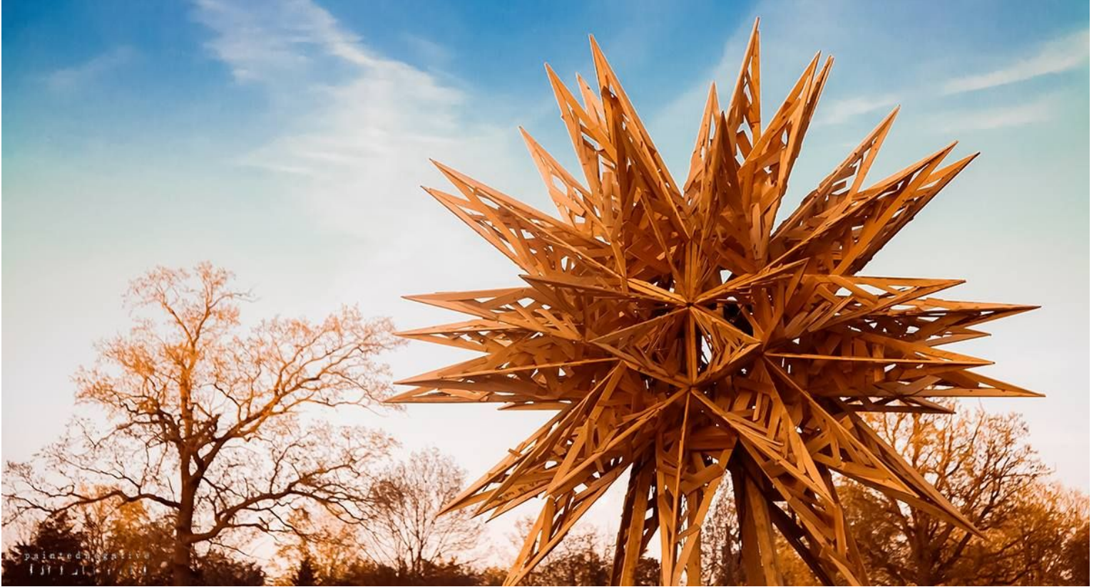
SOLEIL DE MINUIT